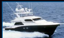
MIKELSON 61 Beam: 18' 06" Range up to 1500nm