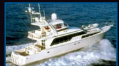
MIKELSON 70 Beam: 19' 06" Range up to 2000nm

619/222-5007 • FAX 619/223-1194 Visit our website: www.mikelsonyachts.com