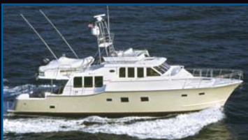
The All New MIKELSON 59 NOMAD LONG RANGE SF Has Arrived! Huge cockpit, in-transom bait tanks & massive fish boxes! Call For a Private Showing.

Mikelson 43, 50 and 57 are now certified. Larger Mikelson models have optional certification.