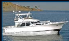
MIKELSON 57 Beam: 17' 11" Range up to 1500nm