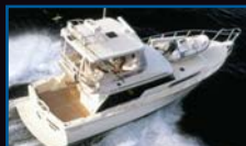
MIKELSON 43 Beam: 15' 08" Range up to 700nm